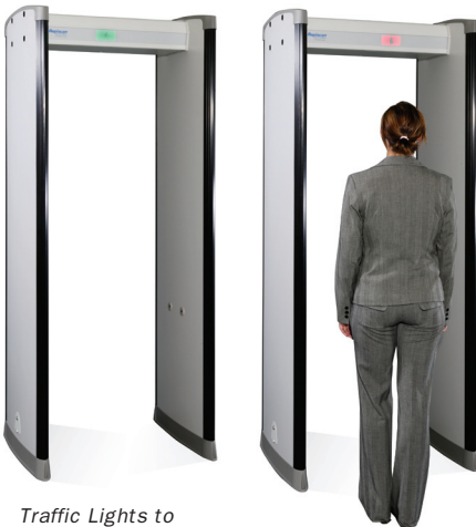
Traffic Lights to optimize passenger flow

The Metor 300 EMD has an excellent discrimination of shoe shanks, belt buckles and other harmless items, thus reducing the nuisance alarm rates and in turn improving the throughput. This does not compromise the detection of threat objects including knives.